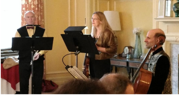
Musicians of Ma'alwyck at the University Club