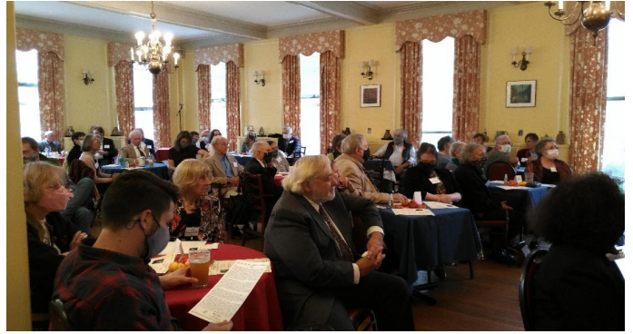
Musicians of Ma'alwyck at the University Club