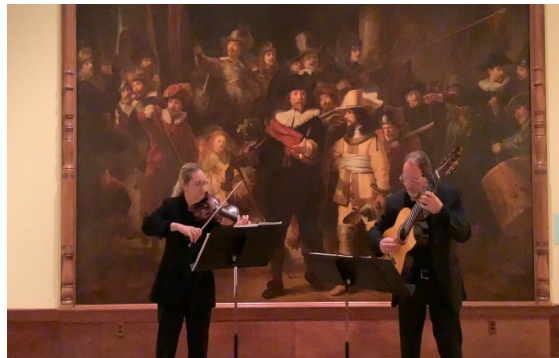
Night Watch Revelry—Arkell Museum