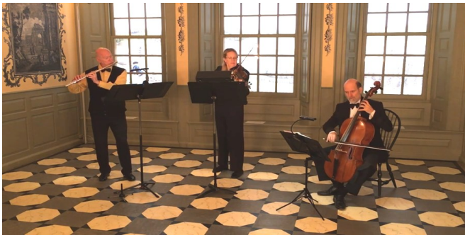
Queen Charlotte's Musicians & Their Circle —Schuyler Mansion