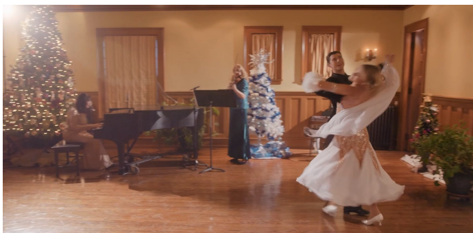
Silent Night—Woman's Club of Albany