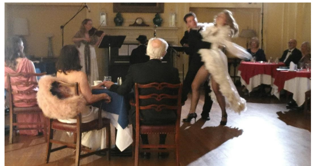
It Had To Be You—University Club of Albany