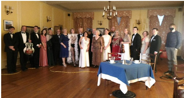
It Had To Be You—University Club of Albany